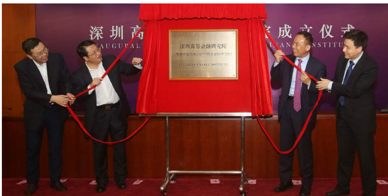
高金院揭牌仪式 Plaque-unveiling Ceremony for Shenzhen Finance Institute

中国金融研究领域再添一块金字招牌。1月12日，深圳高等金融研究院（“深高金”）在深圳市中心正式揭牌成立，研究院由深圳市政府依托香港中文大学（深圳）筹建，由著名经济学家、香港中文大学原校长、全国政协经济委员会副主任刘遵义教授担任理事长，香港中文大学（深圳）经管学院学术院长、美国普林斯顿大学金融学教授熊伟担任首任院长。深圳市常务副市长张虎、深圳市副市长艾学峰等深圳市领导以及中国银行业监督管理委员会原主席刘明康教授、香港中文大学（深圳）校长、中国工程院院士徐扬生教授等深高金理事成员与嘉宾出席了仪式。