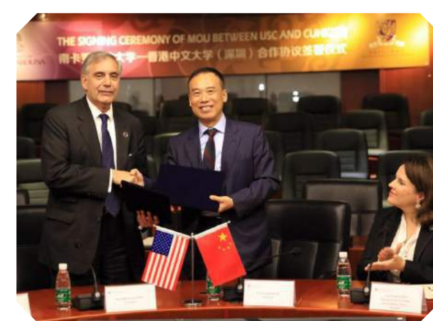
与南卡罗来纳大学签署校际合作协议 Signing of Cooperation Agreement with University of South Carolina

The University will sign a tripartite agreement with University of South Carolina and University of Auckland for nurturing undergraduate students. Under the arrangement, each of the three universities will select 10 students to study in its partner universities for one semester. This global study experience will significantly enrich student academic and cultural lives and expand their global visions.